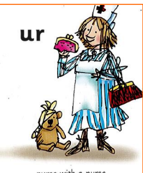
n<u>ur</u>se with a p<u>ur</u>se

3. care, share, dare, bare, spare, scare, flare, square, Clare, software