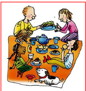
care and share

3. saw, raw, law, straw, dawn, paw, cr<u>aw</u>l, j<u>aw</u>, cl<u>aw, yaw</u>n